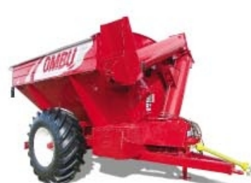
ATA 10 T