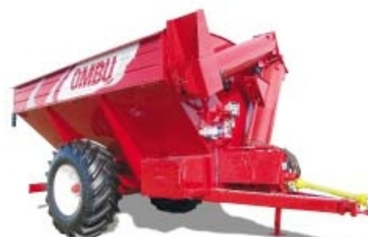
ATA 12 T