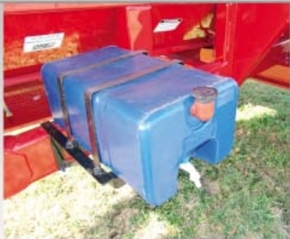
> Water tank & tool box (optionals)