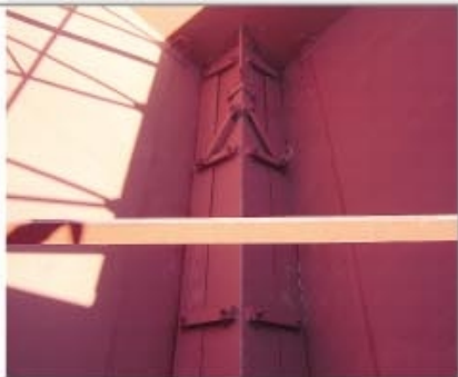
Inner support strings; internal coupling to lift. Regulation guillotine.