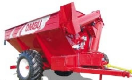
ATA 14 T