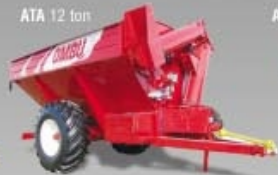
ATA 12 ton