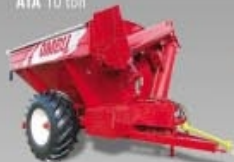
ATA 10 ton