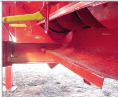
As an optional, a system of fast & uncoupling (Registered Trade Mark OMBU ) is provided to the base of the horizontal auger. This system prevents water and waste stagnation and makes the cleaning of the grain cart easier when different kinds of grains have been transported. Essential in harvesting for seeding plants. (Seeds basket)