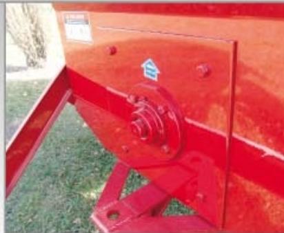
Rear Coupling and removable lid of the horizontal auger.