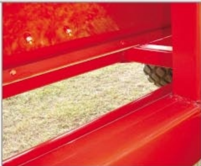
Base for an easy re change.